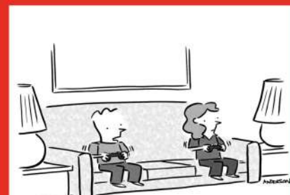
"It's interesting - Mom hates early Christmas sales, but she loves early back-to-school sales."

GET YOUR FREE "CYBER SECURITY TIP OF THE WEEK" AT: